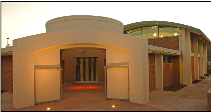
Grossmont College Sculpture Building