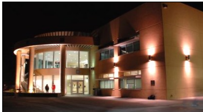
Cuyamaca College Science and Mathematics Center

Grossmont-Cuyamaca Community College District Governing Board